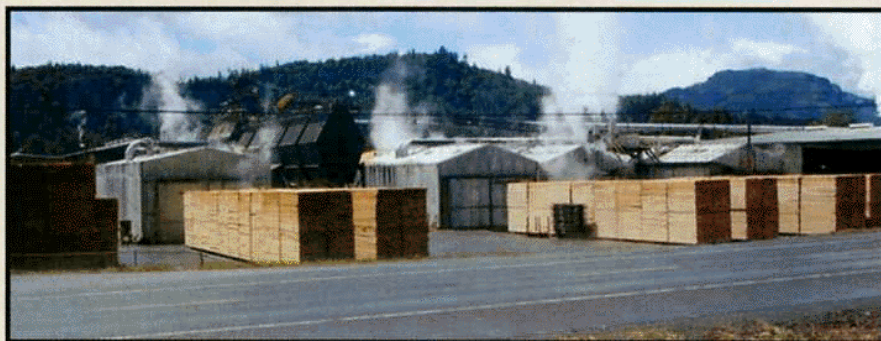
Dry kilns at Hampton Lumber in Randle, Wash.